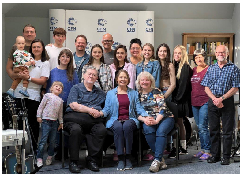
CFN Poland staff and Ukrainians

Poland welcomed refugees from that war-torn country of Ukraine with open arms. The Lord impressed on Joshua to make the school’s dormitories available to Ukrainians. Some of those are not saved—yet!