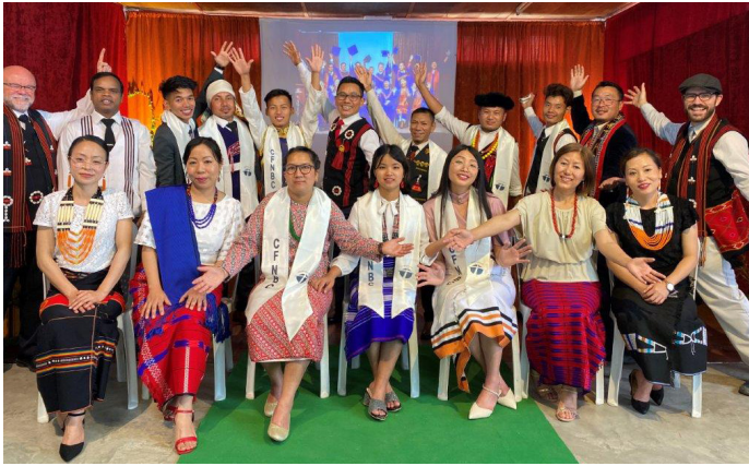
CFNC Nagaland graduates