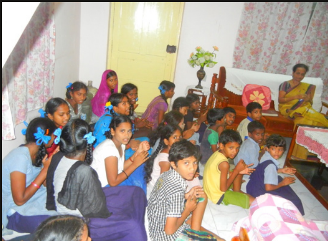
Ministry to orphans in India

In another part of India, one of our Associated Bible School directors has an outreach to the leper villages. Christ For The Nations supports the ministry that helps these lepers, monthly. Would you prayerfully consider giving toward their ministry to help bring the Gospel, healing and support to a group of people the nation considers outcasts?