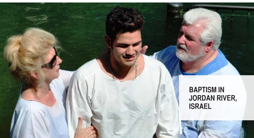
BAPTISM IN JORDAN RIVER, ISRAEL