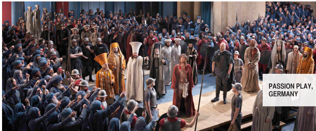
PASSION PLAY, GERMANY