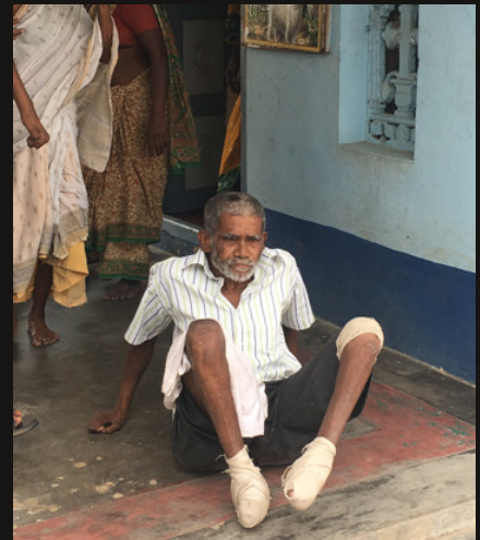
Outreach to leper village is debilitating