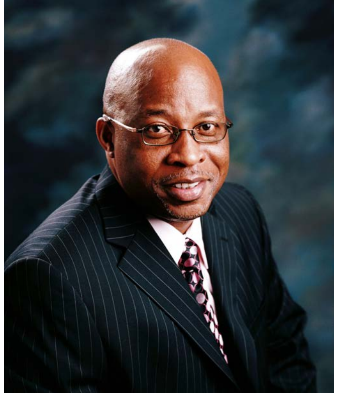
Nevers Mumba, Former Vice President of Zambia and CFNI alumnus