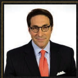
GUEST SPEAKER JAY SEKULOW

Chief Counsel of the American Center for Law and Justice and the European Centre for Law and Justice